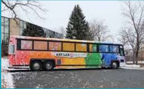
ART Therapy at Mosaic Every Monday 1pm to 3pm