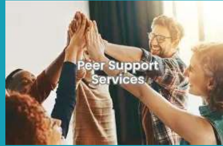
Peer Support Groups at Mosaic Every Tuesday & Thursday 12:30pm-1:30pm