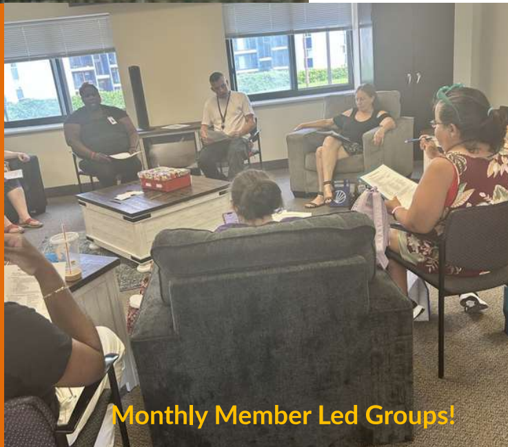
Monthly Member Led Groups!